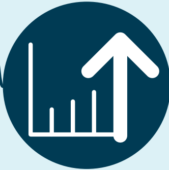
GRP percentage increase over the last year