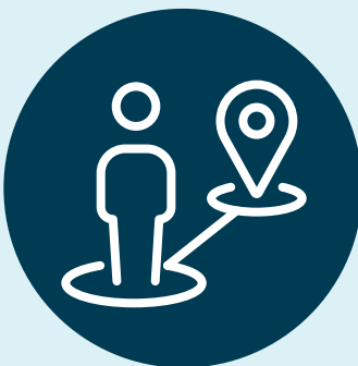
Visitor numbers (FY2023)