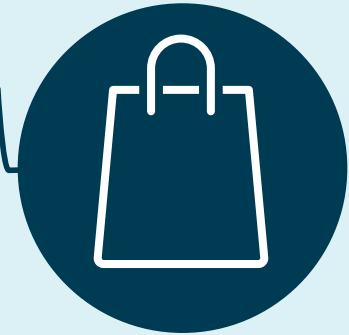
Number of businesses