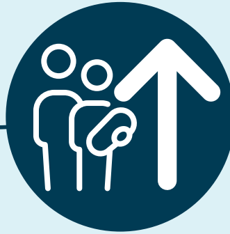
Population increase over the last 5 years