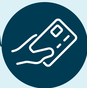
Visitor spending (FY2023)