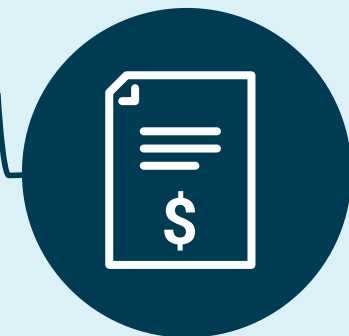
Value of construction certificates (FY2023)