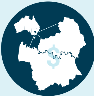
Gross Regional Product