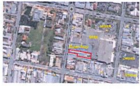
01 EXISTING SITE PLAN