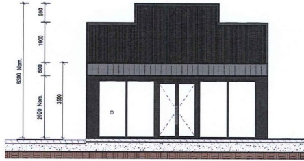
02 EXISTING FRONT ELEVATION As Viewed from Olive Street